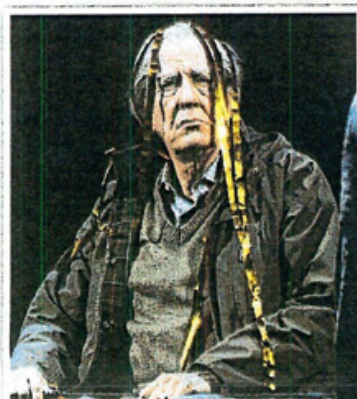
Clockwise from left: Rush and his 1996 Oscar; in Twelfth Night ; receiving the Order of Australia with Governor-General Peter Cosgrove; in STC's King Lear ; on location at Sydney Harbour on Tuesday; and (below left) as Einstein in TV series Genius.

"It does not warrant comment except that it is false and untrue."