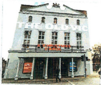
The Old Vic Theatre on The Cut in London.