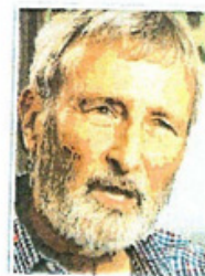
Don Burke being interviewed on ACA.

He has been described as a "sexual predator" and "psychotic bully" during the 17-year run of Burke's Backyard . Speaking to ACA host Tracy Grimshaw, he claimed to be a victim of a "witch hunt" ignited by the Harvey Weinstein scandal.