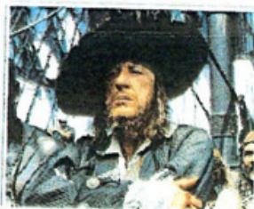
Rush in Pirates of the Caribbean .

"STC complied, acting in the interest of the complainant's health and welfare. As already stated, the Company received the complaint after Mr Rush's engagement had ended."