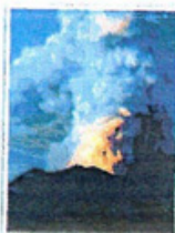
Mount Agung in action.

For example, they might double check it with mainstream news sources.