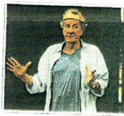
Geoffrey Rush in King Lear rehearsals.

The statement then says Mr Rush can only reiterate that he denies being involved in any "inappropriate behaviour" whatsoever.